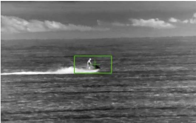
Tracking a jet-ski using IR video

The Vision4ce CHARM 3U video tracker uses the DART (Detection & Acquisition, with Robust Tracking) detection and target tracking software hosted on an embedded multicore ARM processor board for video tracking and image processing applications.