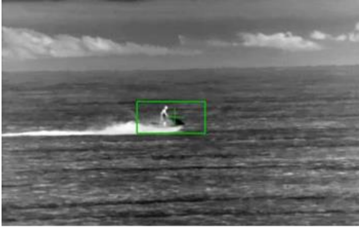
Tracking a jet-ski using IR video

The Vision4ce CHARM-70 product uses the DART (Detection & Acquisition, with Robust Tracking) detection and target tracking software hosted on an embedded multicore ARM processor board for video tracking and complex image processing applications.