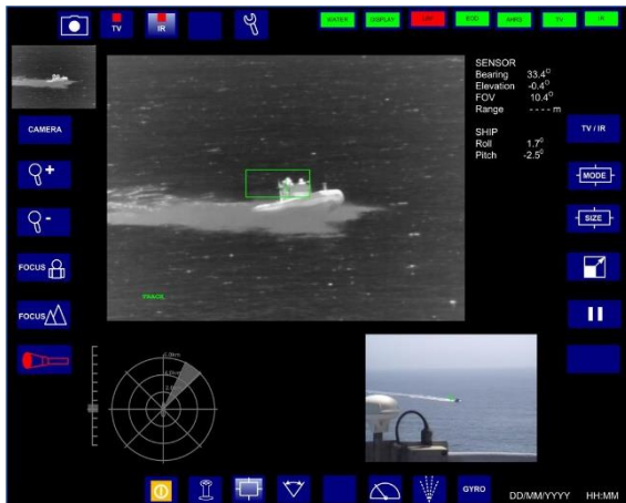
GRIP-VMS Graphical User Interface